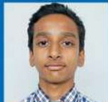
POWELL (95.8%) MOOTHEDEAN