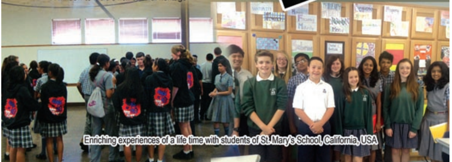
Enriching experiences of a life time with students of St. Mary's School, California, USA