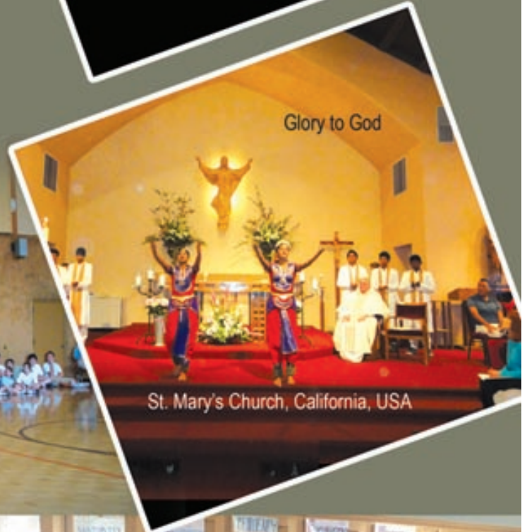
Glory to God