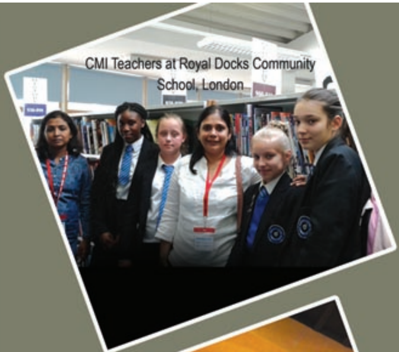
CMI Teachers at Royal Docks Community School, London