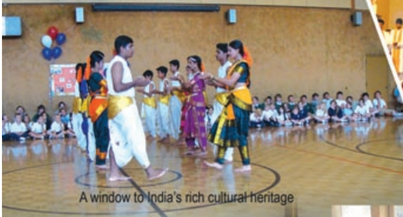
A window to India's rich cultural heritage